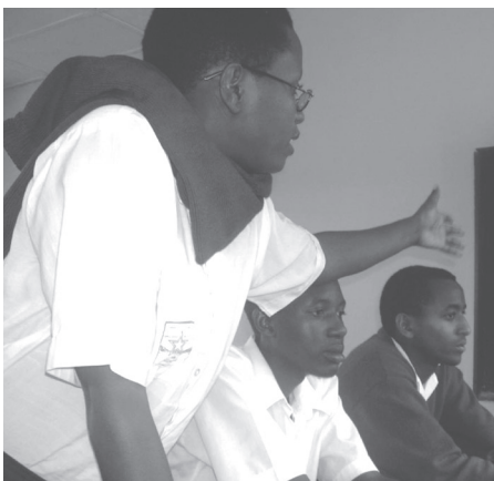
▲ Rwandan students engaged in discussions during the Day of Prayer.

According to Mr. Israel, it is the poor who pay the most when the environment deteriorates. He urged the faithful to think of others in everything they do, and to show modesty and moderation in their use of natural resources. ■