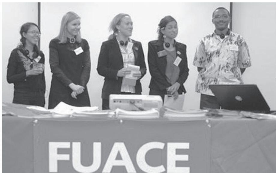
▲ Committee members come from around the globe and bring extensive grassroots experience to the advocacy work.

Most committee members have extensive grassroots experience in human rights advocacy but the training exposed them to the international scene "so that they can have the knowledge they need to take a lead